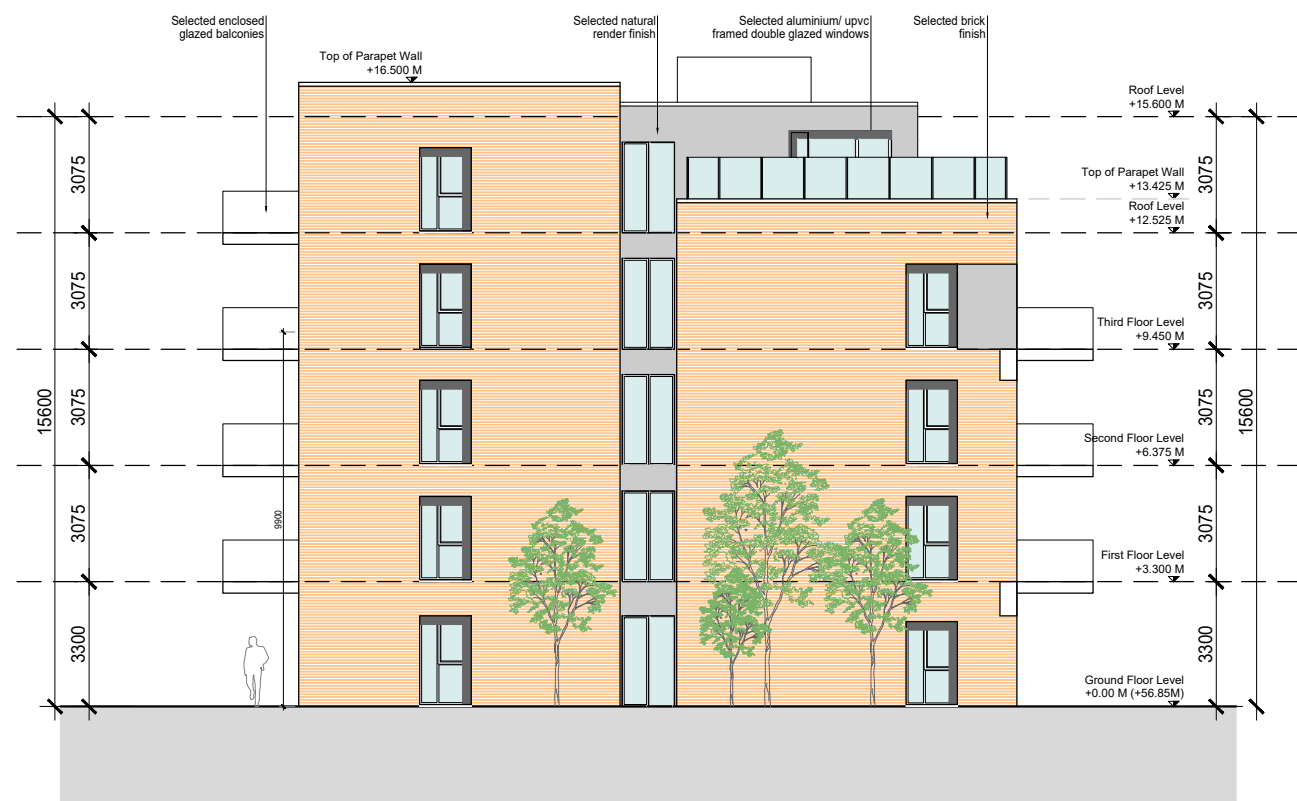
Block A - South Elevation