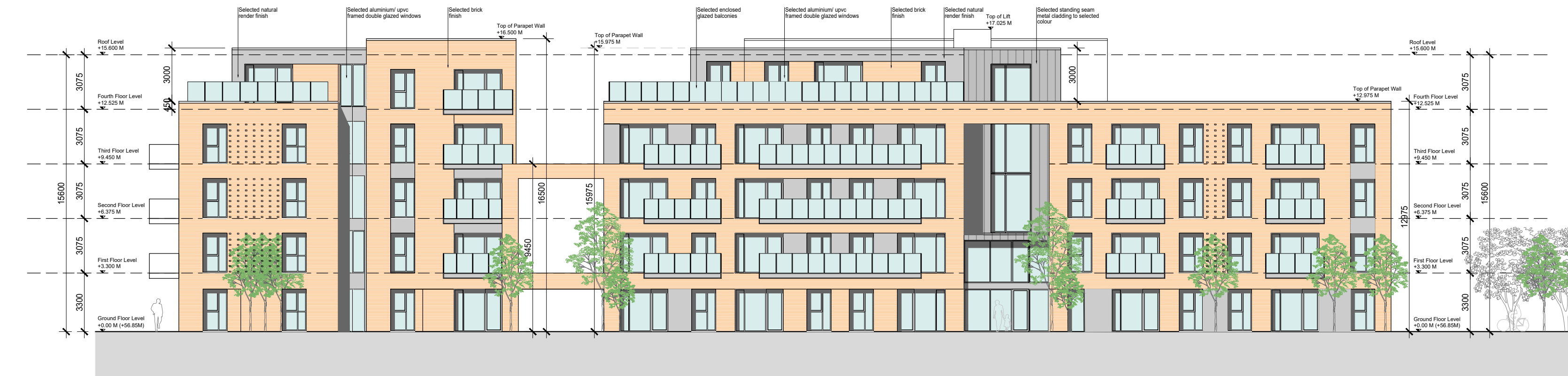
Block B - East Elevation