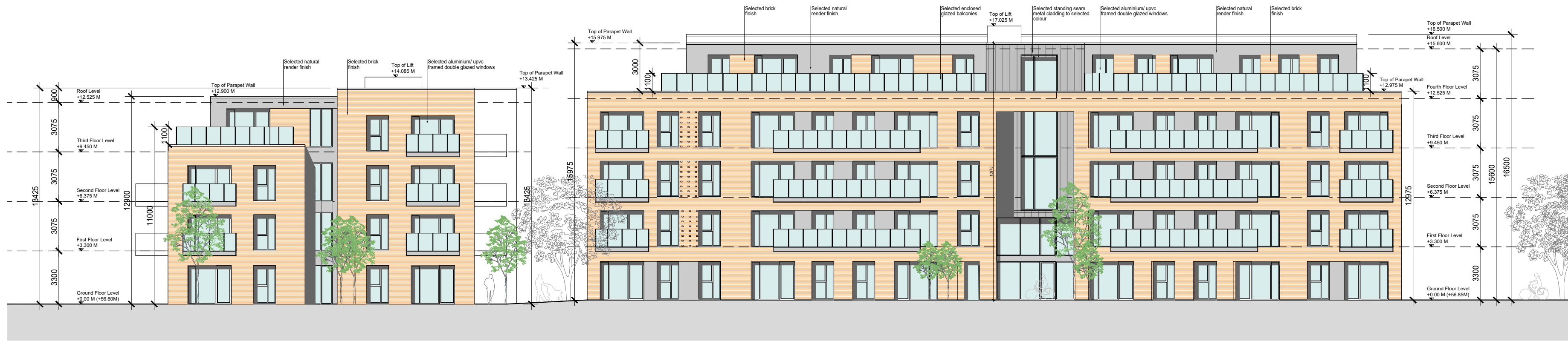
Block C - South Elevation