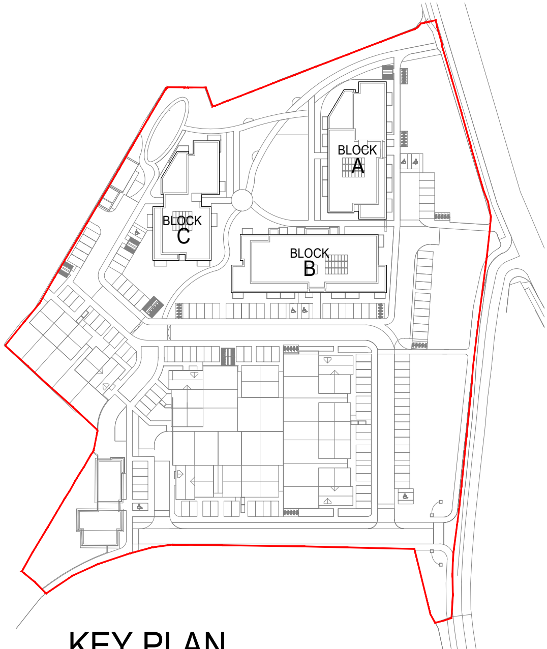
KEY PLAN NOT TO SCALE