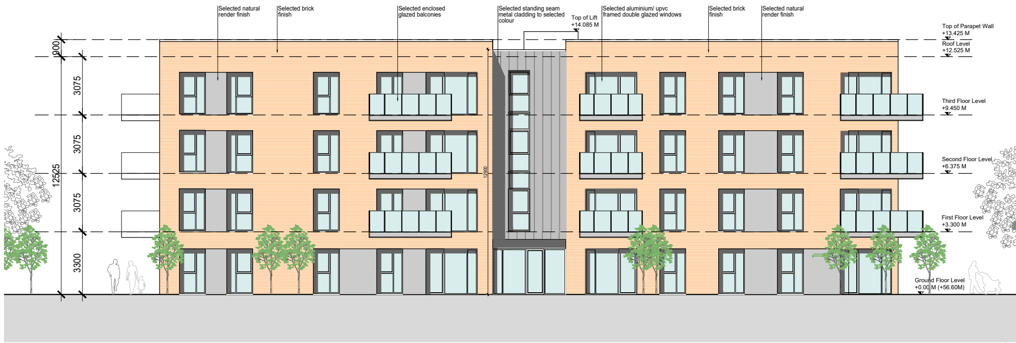
Block C-East Elevation