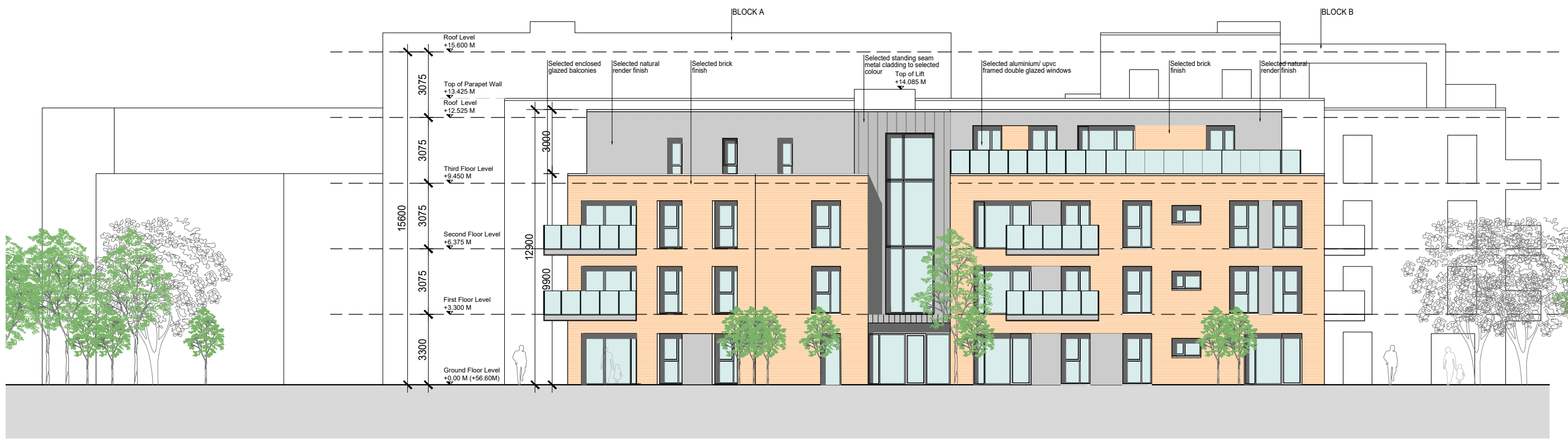
Block C-West Elevation