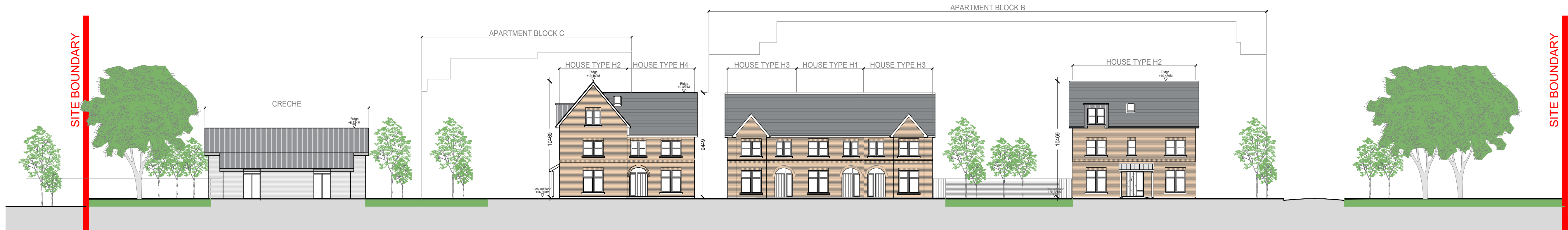
Site Section A-A - Scale 1:200