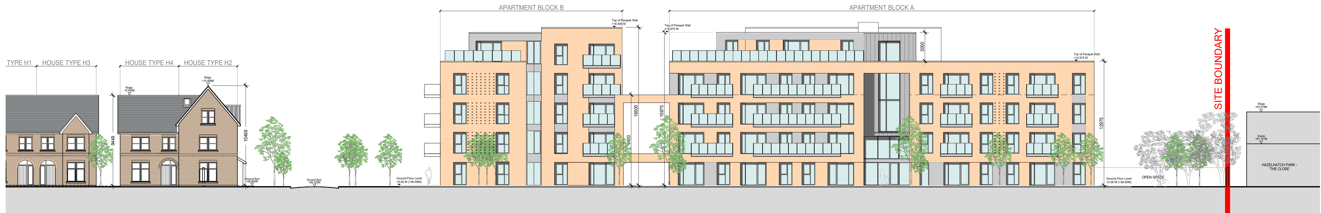
Site Section B-B (Part 1) - Scale 1:200