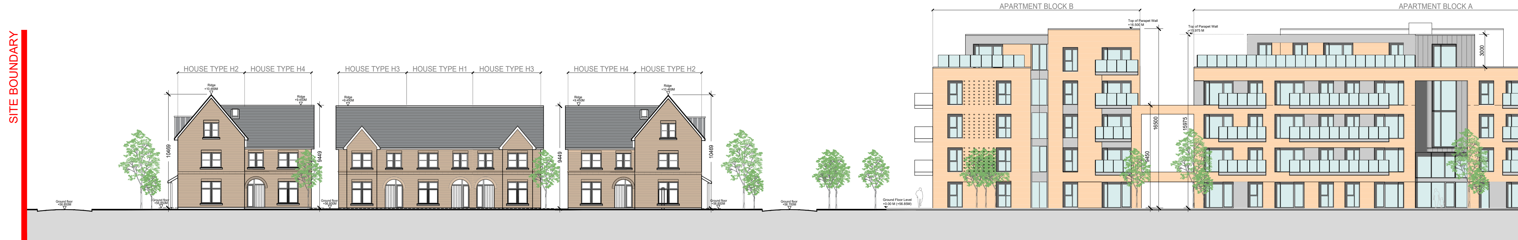
Site Section B-B (Part 1) - Scale 1:200