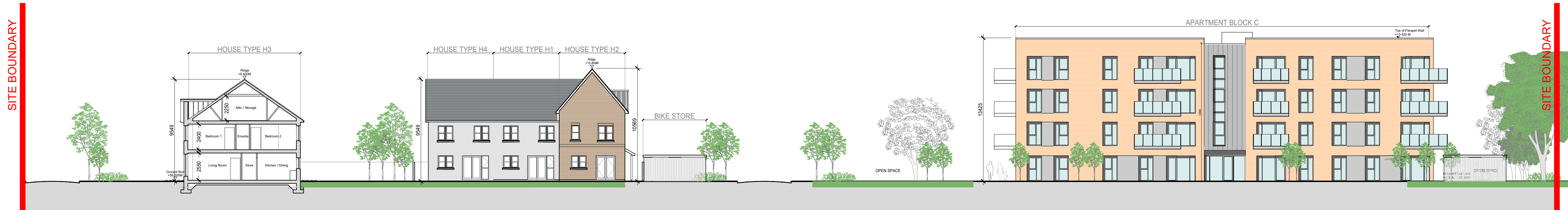
Site Section C-C - Scale 1:200